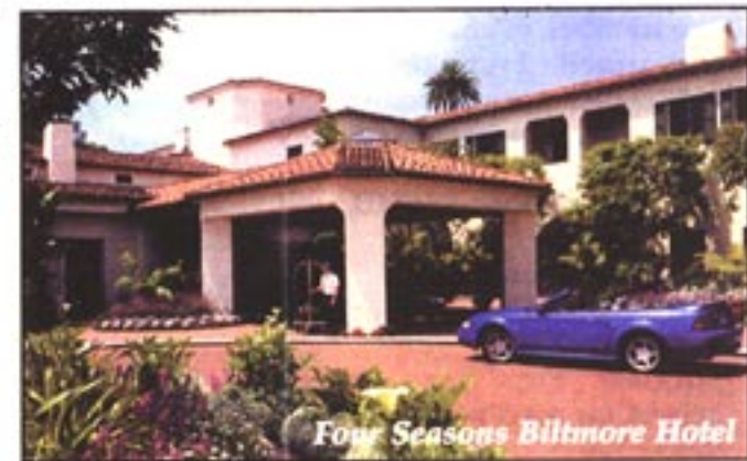
Four Seasons Biltmore Hotel